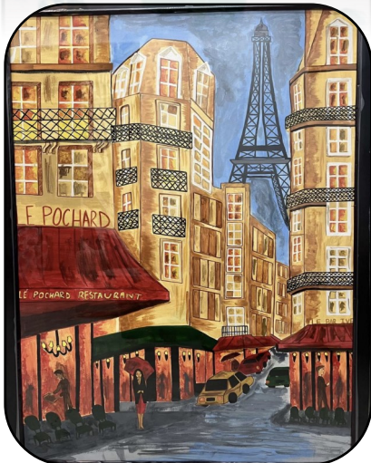
MANYA TINNA - VIII D