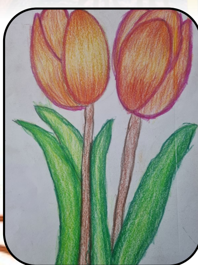
PAAVNI SARASWAT - III H