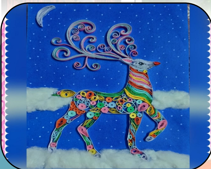
AASHNA BHALLA - VIII A