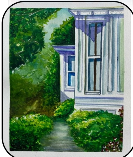
SIA - XII D