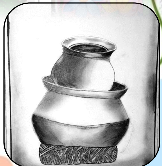
AVANI - XII