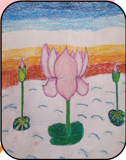
KAYRA PODDER - III H