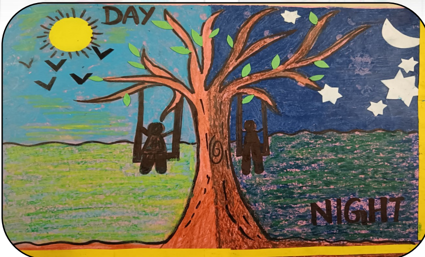
PRANAV KAKKAR - IVA