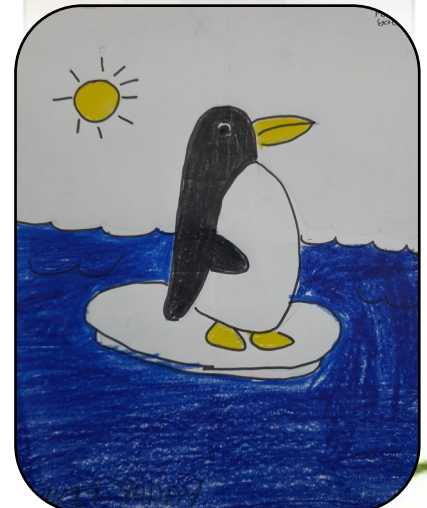
PULKIT YADAV - III I