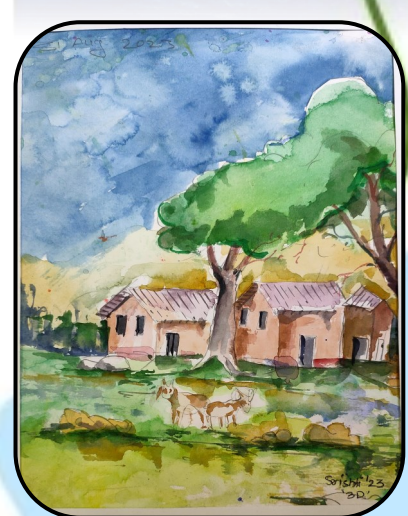
SRISHTI - III D