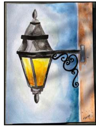
MANYA TINNA, IX-F