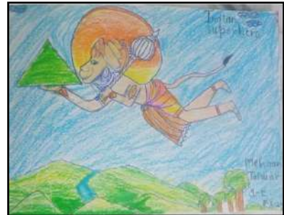
MEHAAN TALWAR, 1-E