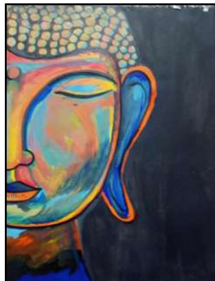
ABHAV NARULA, IV-F